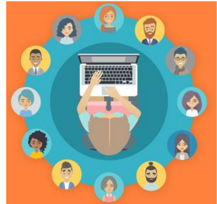
Image: © 2020 The Health Foundation & NHS Improvement https://q.health.org.uk/idea/2019/virtual-group-clinics/